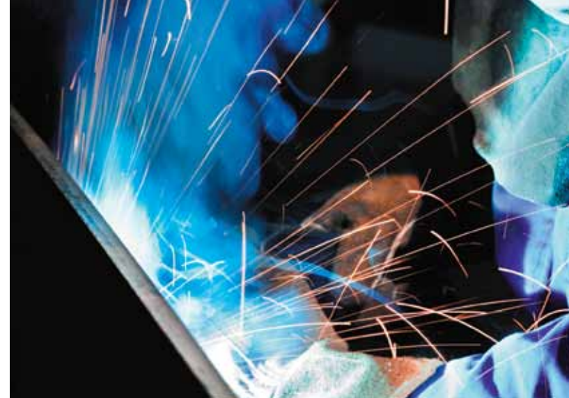
Welding of the base metal is done with standard welding techniques